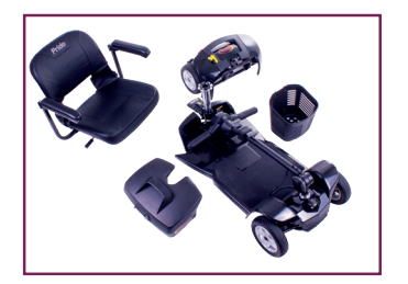
Disassembles into 5 Pieces