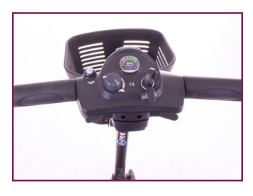
Easy to Use Scooter Controls