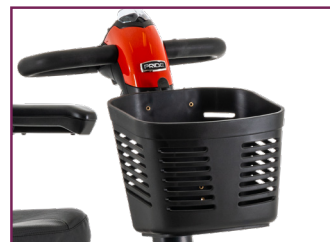
Convenient Front Basket