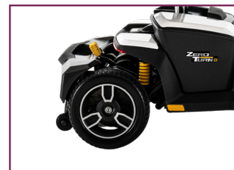
Exclusive & Stylish Low Profile Tyres