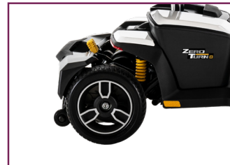
Exclusive & Stylish Low Profile Tyres