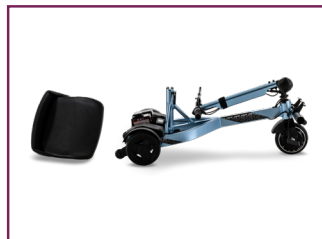
Fordable Tiller With Adjustment Knob