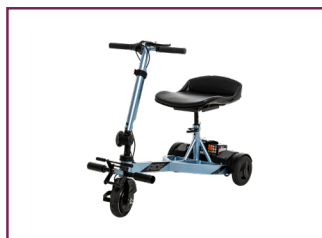
Portable and Easy to Travel