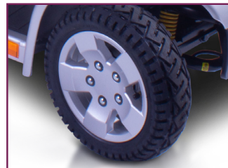
13" Alloy Style Pneumatic Tyres