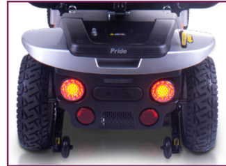
High Visibility Front and Rear LED Lighting