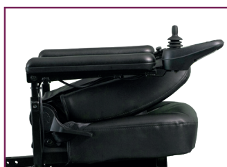
Fold Flat Seat