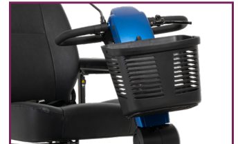
Easy Control Tiller