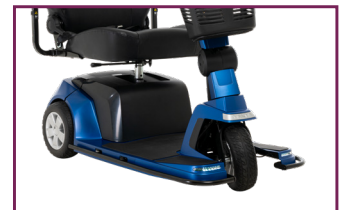
Available in a 3 or 4 Wheeler