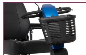
Easy Control Tiller