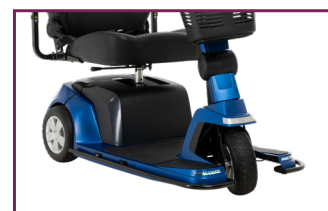
Available in a 3 or 4 Wheeler