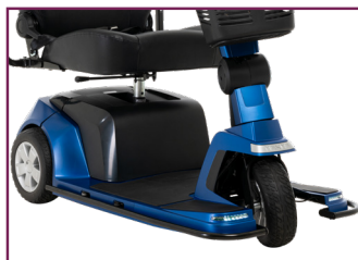
Available in a 3 or 4 Wheeler