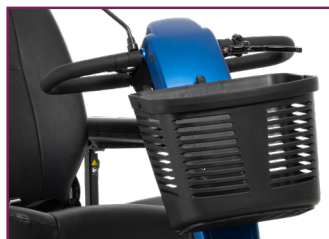
Easy Control Tiller