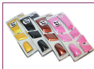
Optional Colour Shrouds