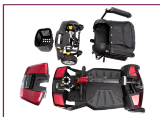
Compact, Foldable Seat With Armrests