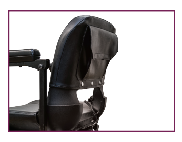
Large Back Pocket For Storage