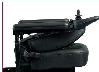
Fold Flat Seat